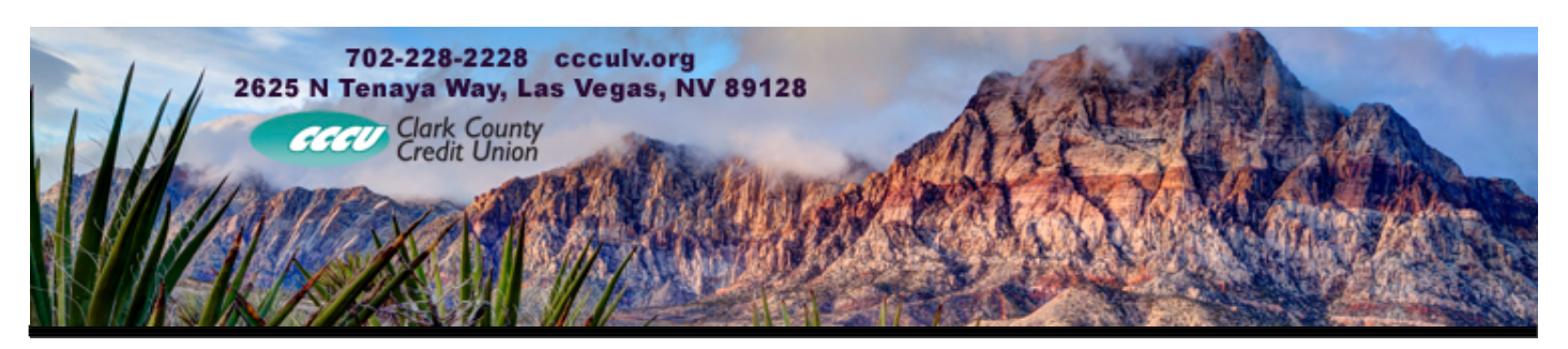
Volume Issue • August 2014