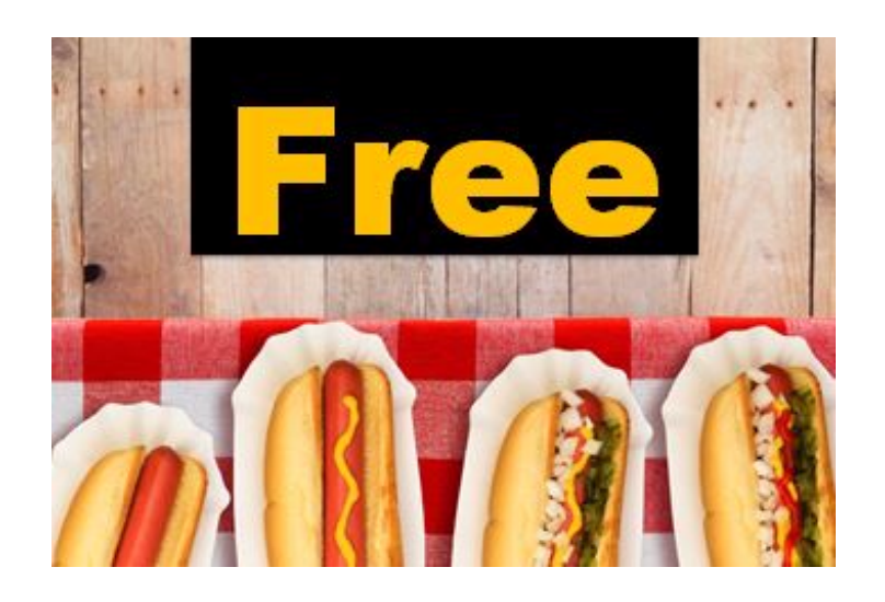
Come visit the hot dog stand and enter to win an iPad.